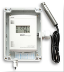
Protective Case for LCD Logger U14-CASE-4x 1.7 x 12.7 x 5.7 cm (6.75 x 2.25 in) 315.2 g (11.2 oz)